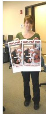
Toy Drive at Workplace Success

Salem Service Bureau volunteers helped obtain a very large truckload of toy donations for Toys For Tots by connecting with area businesses and becoming an official drop off location for Toys For Tots.