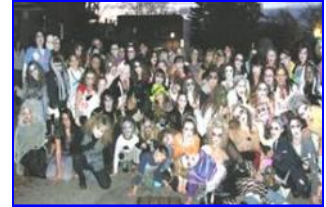
Rochester Main Street Horribles Parade that Rochester Service Bureau volunteers helped with

assistance and Community Closet with help sorting through the clothing donations.